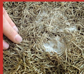
Grey Snow Mold

Email: Edsmith@hmlandscaping.com or Phone # 440-564-1157.